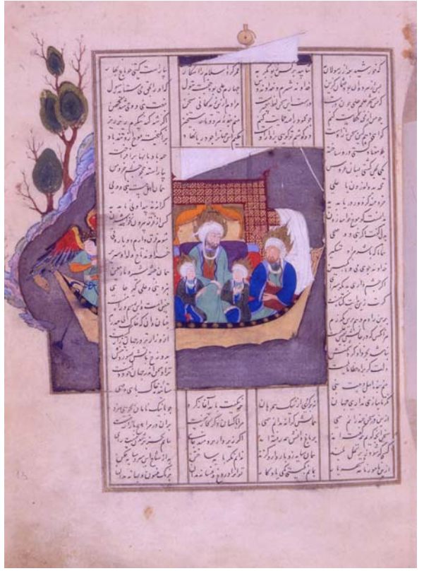
St Petersburg IOS – C822, fol 011r

interpretations of the sources available and make inferences from them.