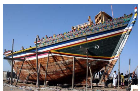
Ship under construction, al-Ghurayrah, Yemen

The £750,000 MARES Project is a multidisciplinary, multi-period research programme that focuses on the maritime traditions of the peoples inhabiting and travelling on the two great seaways flanking the Arabian Peninsula. It aims to draw on ethnography, anthropology, archaeology, history and linguistics in a bid to understand how people made their lives on and alongside these seas in late antiquity and the medieval period, and how they have done so in the recent past.