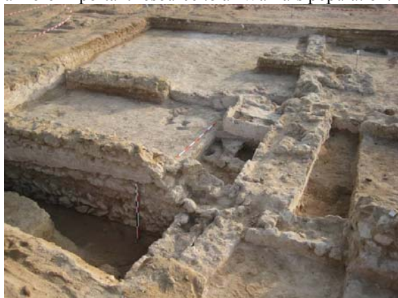
Multi-phase dwelling at al-Wakra

Preliminary results suggest that fish would have been a more important resource to al-Wakra's population.