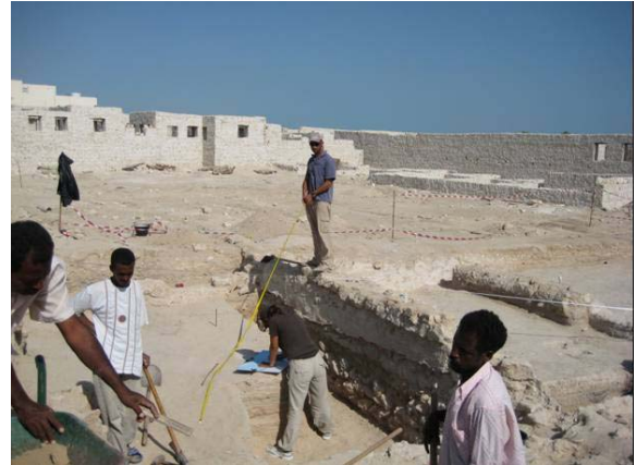
Archaeological work at al-Wakra

and doorways, and a large courtyard area to the east. Ceramics recovered from these occupation layers date to the 18 th –19 th centuries.