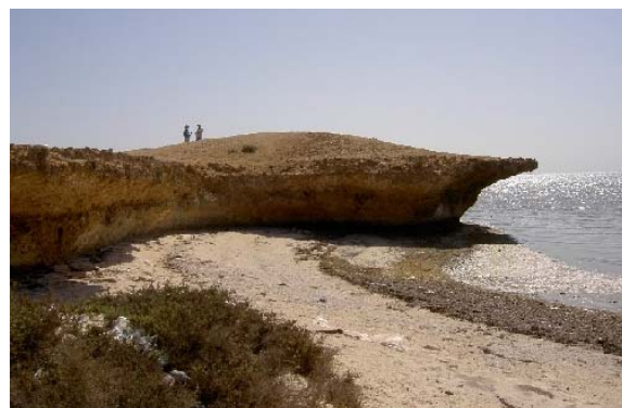
A shell mound in the Farasan Islands

These new hypotheses raise a number of questions. At what point were early human groups able to cross the southern end of the Red Sea? Would they have required boats? Or did sea-level changes create an intermittent land bridge? When did marine resources become a significant part of human subsistence, opening up new opportunities for human settlement and movement in coastal zones? A major problem is that for most of the period in question, indeed for most of human existence, sea-levels were substantially lower than the present, at maximum about 120 m below present level. This means that most of the relevant evidence is now deeply submerged on the seabed and perhaps destroyed or buried under thick layers of marine sediment. We know that the marine resources of Arabian waters are very productive, especially in the Gulf and in the southern Red Sea. Archaeological sites attesting to shell gathering and fishing, often in the form of shell mounds, are common from about 7,000 years ago, but this is precisely the period when sea level stopped rising after the melting of the continental glaciers of the last ice age. Therefore earlier coastal sites, if they existed, are now deeply submerged.