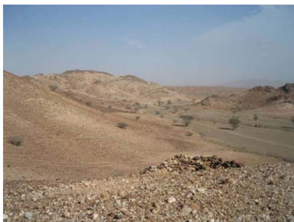
Figure 1: Foothills of the mountains located between Idhn and al-Ghayl, Ras al-Khaimah, UAE.

In January 2008 preliminary fieldwork was undertaken to identify potential areas of Palaeolithic occupation in the Emirate of Ras al-Khaimah, United Arab Emirates. This focused on the geological formations in the foothills of the mountains located between Idhn and al-Ghayl (Figure 1). Chert outcrops are located in the vicinity of Jebel as-Selwa and Jebel al-Hamrah along the Wadi al-Riyan at altitudes between 150-239 m asl. Key sites sampled are listed in Table 1. Stone artefacts were found as surface scatters of varying densities on the chert outcrops of the Hawasina series, including cores, flakes and endscrapers (Figure 2). Most are manufactured from reddish brown chert, which caps the low hills.