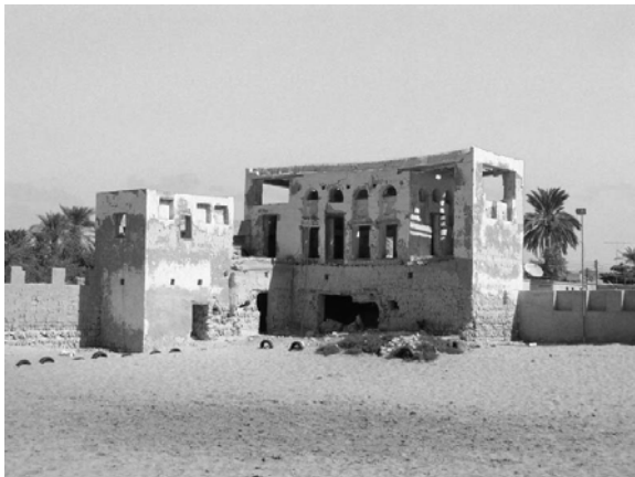
The Bait Sirkal in Ma'arid

Shifting Power Line. The Department was able to change the course of a power line planned over the historical summer residence of the ruling Qawasim family in Falayah, the famous location where the peace treaties between the British and local shaikhs were signed in 1820. The Department succeeded in implementing more changes of this power line north of Ras al-Khaimah, thus preventing visual and physical damage to Dhayah, one of the most important environmental, archaeological and historical areas of the emirate. The proposed, original course of the power line led to further surveys in the area of Dhayah and in the mountains and plateaus above.