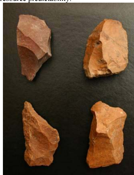
Figure 2: Chert lithic material from O27, Ras al-Khaimah

to topographic relief, phytogeographic distribution, and resource predictability.