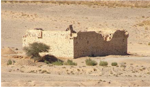
Qal'at Fassu'a an 18 th century fort in southern Jordan

To a certain extent the loss of al-Hasa and Yemen is a reflection of events elsewhere in the Empire, though there are also certain factors which specifically relate to Ottoman rule in Arabia. One important factor in this situation is religion – whereas the Ottomans were followers of Sunni Islam, within the province of al-Hasa and Yemen there were significant numbers of Shi'a who were regarded as suspicious and potentially hostile by the Ottoman rulers. Other factors include the way the provinces were administered; thus instead of the usual timar system of land grants, the provinces were administered as tax farms with revenues payable in cash to the central government. This tax farm system encouraged local governors to extract the maximum revenue during their period of tenure and alienated local populations. However, problems of over-taxation were not confined to the Arab provinces, and other causes for the rapid loss of Yemen and al-Hasa must be sought.