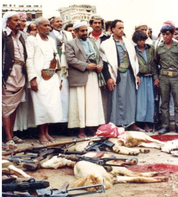
Shaikhs and government officials with animals slaughtered as apology and entreaty for reconciliation after an inter-tribal conflict, Jabal Razih, 1985