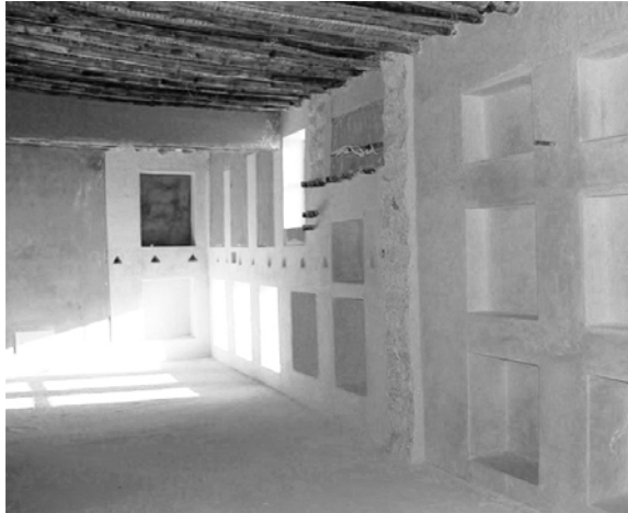
L-shaped room at Ras al-Khaimah Fort

remains of the old wall, which was cut during the enlargement process, were made visible by projecting it a few centimetres into the room on both sides. Future visitors will be able to understand the original structure and its changes through time, seeing the remains and being guided by drawings and explanations.